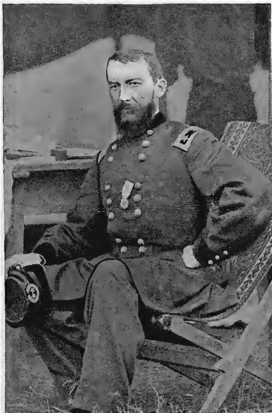
GENERAL PHILIP H. SHERIDAN